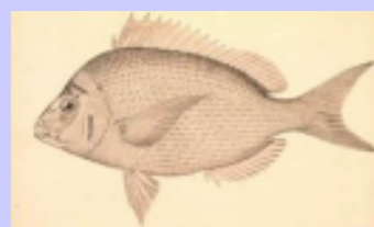
Scup or Porgey (Stenotomus chrysops)