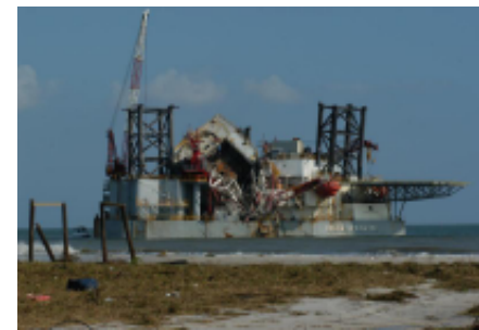
A Katrina victim lands onshore at Dauphin Island, Alabama. This was 1 of 114 oil platforms/rigs damaged or destroyed during Hurricane Katrina.