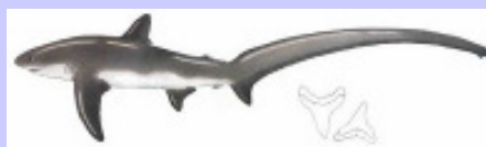
Thresher Shark ( Alopias vulpinus )