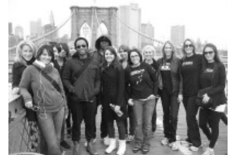
Brooklyn Bridge Walk-for-Water