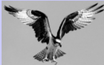
August Creature Feature

August's creature feature is a bird that is known for diving feet first to catch fish - which makes up 99% of its diet. In addition to trees, this bird may build nests on telephone poles, street lights, and constructed platforms. The wingspan ranges from 5 to almost 6 feet. For a chance to win a COA T-shirt, submit your guess to Judge Hallie But by mail, fax, email (18 Hartshorne Dr., Suite 2, Highlands, NJ 07732; fax: 732-872-8041; science@CleanOceanAction.org) or by visiting CleanOceanAction.org. Only one entry per person please.