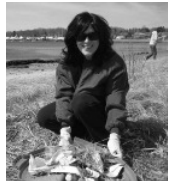
Aveda volunteer at Beach Sweeps in Sandy Hook