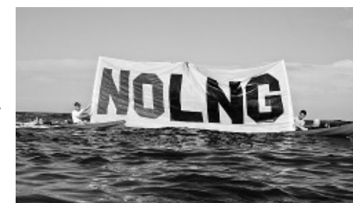
Paddle-out protesters held up a giant No LNG sign.

The event kicked off the 19th Annual Clean Ocean Action Shore Tips (C.O.A.S.T.) campaign. C.O.A.S.T. information tables are set up along the beaches in Monmouth and Ocean Counties on weekends throughout July and August.