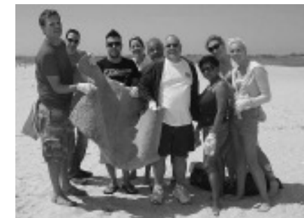
Aveda at a Jones Beach Cleanup