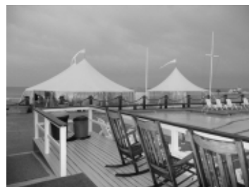
Ship Ahoy Beach Club

Warm Weather is Right Around the Corner!