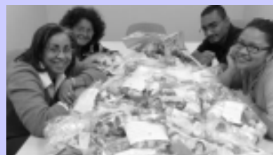
Panasonic's Bottle Cap Team

To honor Panasonic's 50th Anniversary , the employees of Panasonic hosted a "Lid Flipping" Plastic Bottle Cap Recycling Contest. Their goal was to collect 5,000 caps to honor the company's 50th anniversary. Instead, they collected over 16,000 caps to be sent to Aveda for recycling from three facilities in Elgin, IL, one facility in Chesapeake, VA, and their Panasonic's headquarters in Secaucus, NJ. The employee who won the bottle cap recycling contest collected 1,600 caps.