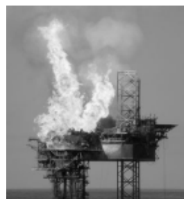
The fire that erupted on November 1, 2009

On August 21, one of the worst oil spills in Australian history occurred with new "state of the art" offshore drilling technology. Despite all the Big Oil claims that offshore drilling is now clean and safe, this example proves otherwise. The spill took 74 days to stop that ended with a three day out of control fire. The oil slick spread across more than 9,000 square miles, larger than the size of New Jersey. It was estimated that nine million gallons of oil poured into the ocean (Exxon Valdez was 11 million gallons). The spill took place in the Timor Sea