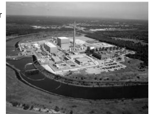
Aerial view of the Oyster Creek Nuclear Generating Station in Lacey Township