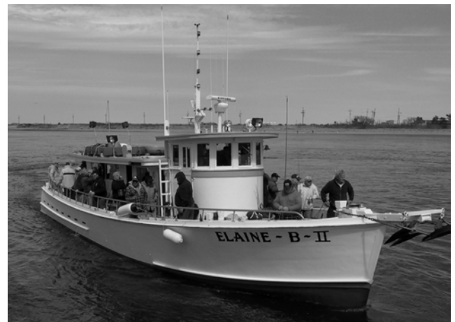
The Elaine B returns to the dock after a day of flounder fishing