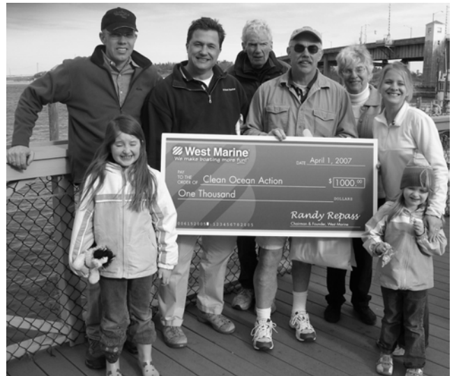
West Marine staff, event Committee, and crew celebrate the $1,000 donation from West Marine to generously support COA's programs and tournament festivities.