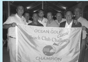
2007 Beach Club Challenge Champion: Chapel Beach Club, Sea Bright

(Sea Scenes appears every other month in the Clean Ocean Advocate .)