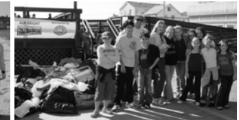
Nearly 300 volunteers swept the beach clean at Sea Bright Public Beach