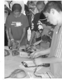
Students observe and take measurements of a horseshoe crab, an animal that pre-dates the dinosaur

The Spring Student Summit for schools in northern and central NJ is scheduled for May 8 & 9, 2008. Applications will be available in February.