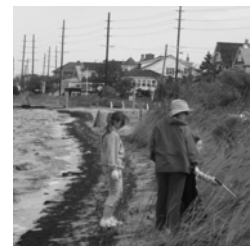
Volunteers clean Barnegat Bay's shoreline in Seaside Park

Sandy Hook - Over 300 volunteers removed 4,229 plastic caps and lids and some odd items including a kazoo, a coconut, and an Easter basket from ocean and bayside beaches within the park.