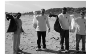
United Teletch employees show their bags of trash collected at Sandy Hook

Most of all, COA thanks the dozens of volunteer Beach Captains and the municipalities who participated in the statewide event.