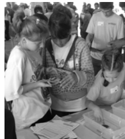
Students carefully touch and learn about a sea star, one of the many invertebrates on display in the environmental workstations