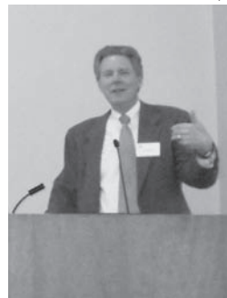
U.S. Representative Frank Pallone delivers the keynote address

The Symposium's keynote address was given by U.S. Representative Frank Pallone who spoke about how clean beaches and waterways are essential for our economy, our health, and our environment. He explained how important it is to gather data when conducting cleanups to emphasize the need for action.