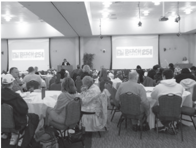
Citizens gather to show their interest and support for a clean ocean

To view additional Symposium pictures visit CleanOceanAction.org